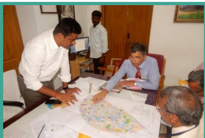
Demonstration of Decision Making Process by District Authorities at the District Emergency Operation Centre (EOC)

In line with above, templates for preparation of respective off-site EPR plan were prepared and issued to the district authorities and NPPs by respective agencies (NDMA to District authorities and NPCIL-HQ to NPPs). The template for offsite plan of NPPs was reviewed and approved by AERB. The template includes a revised overall response framework for off-site emergency to ensure an effective and co-ordinated response. This has been evolved through consultation among utility, CMG-DAE, NDMA and AERB. The template also covers various aspects of EPR plans including, classification, declaration and notification of emergency, protection strategy with focus on doing more good than harm, public communication, infrastructure for decision making during emergency exercises, comprehensive list of procedures for implementation of the emergency