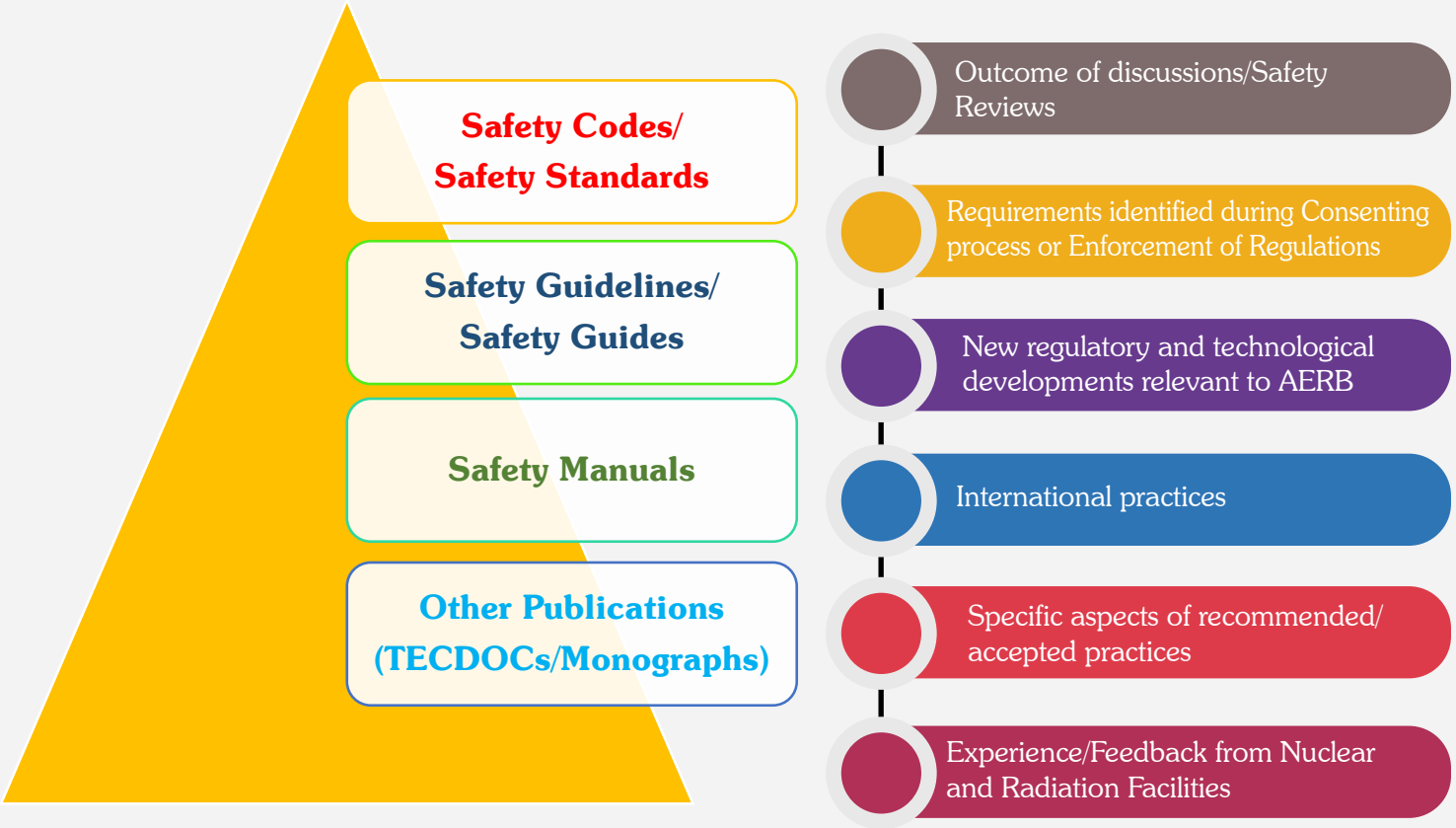
Hierarchy of REGDOCs

The REGDOCs issued by AERB are categorized in the following hierarchy. Also, following aspects are taken into account during preparation of REGDOCs: