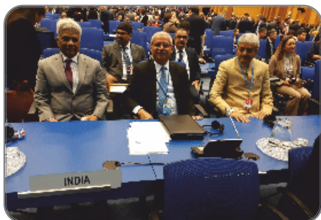
Glimpses of IAEA General Conference

with delegation from regulatory bodies of Slovak Republic, VietNam and Argentina arranged during the General Conference.