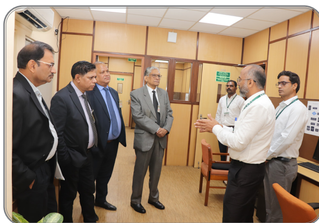
AERB Officials interacting with Delegates from Bangladesh at NREMC

A delegation from Bangladesh visited Atomic Energy Regulatory Board (AERB) on November 21, 2023 and held discussion with AERB officials as part of the 4 th Joint Committee Meeting between India and Bangladesh. During the discussion both the parties affirmed to carry forward the technical co-operation between AERB and Bangladesh Atomic Energy Regulatory Authority (BAERA) under the bilateral arrangement. The delegates also visited Nuclear and Radiological Emergency Monitoring Centre (NREMC) at AERB.