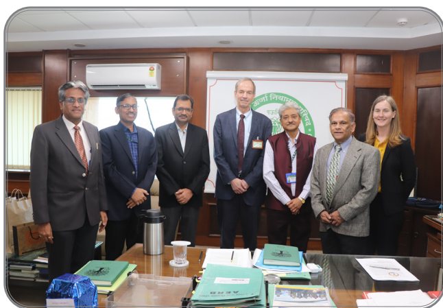
AERB Officials with USNRC Delegates

A bilateral meeting was held with United States Nuclear Regulatory Commission (USNRC) at AERB, Mumbai during February 13-15, 2023. The meeting was arranged in hybrid mode. Some of the important issues discussed during the meeting were emergency preparedness and response, new reactor technologies, industrial radiography practice, regulatory control during transport of radioactive material and management of disused sealed sources.