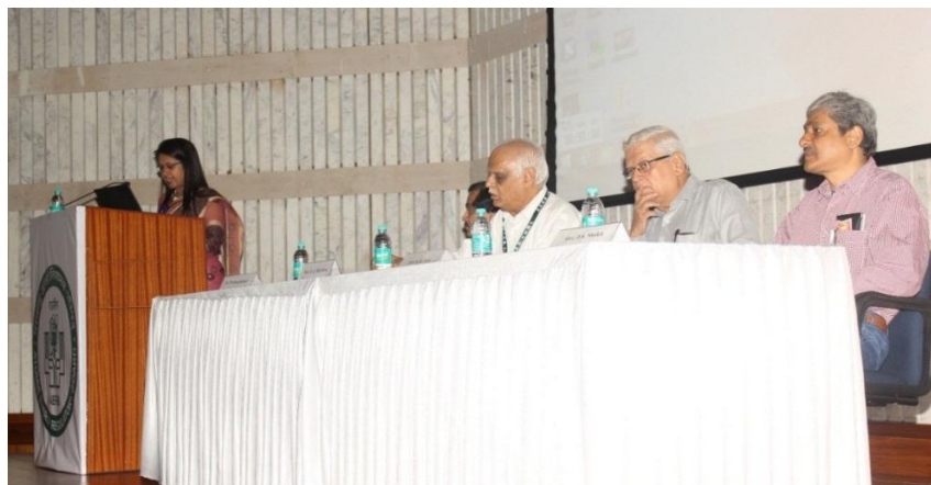
Dignitaries on Dais during Inaugural Session of Discussion Meet on RIA and OIL

The discussion meet involved detailed presentations & talks by experts in the fields of RIA and Emergency Preparedness, from AERB, BARC, IGCAR and NPCIL. About 200 delegates from NPPs, NPCIL-HQ, BHAVINI, BARC, IGCAR and AERB participated in the discussion meet and put forth their views/opinions, queries raised were responded.