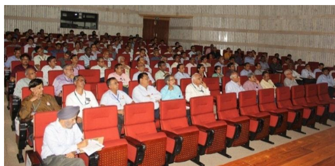
Participants of Discussion Meet on RIA and OIL