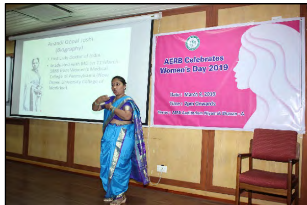
Glimpses of Cultural Programme on Women's Day Celebration