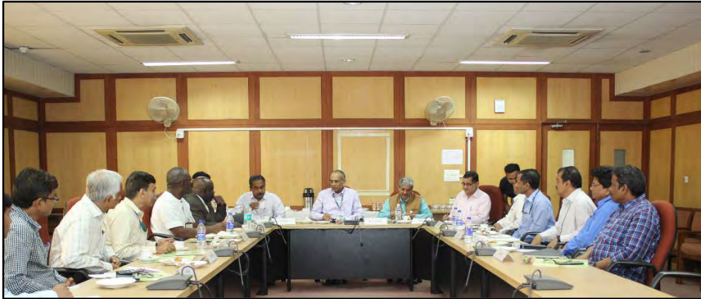
Chairman, AERB interacting with delegation from GAEC