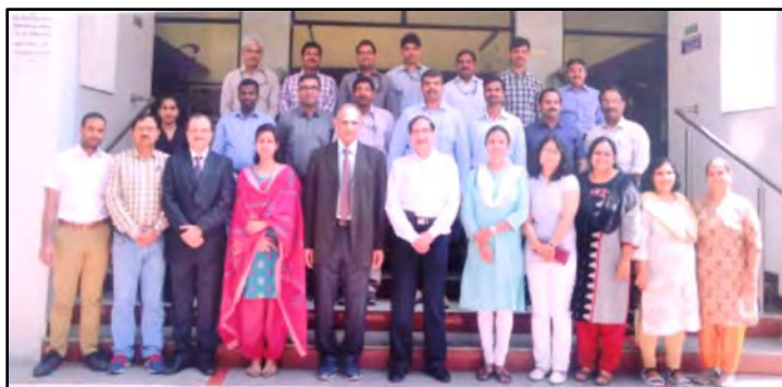
Participants of MDP at YASHADA, Pune