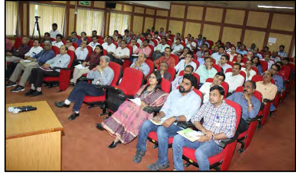
Participants in the theme meeting

The programme was a successful step towards development of understanding about C-14 generation in reactor systems, its pathways to deliver dose to public and to plan the future course of action regarding regulatory oversight.