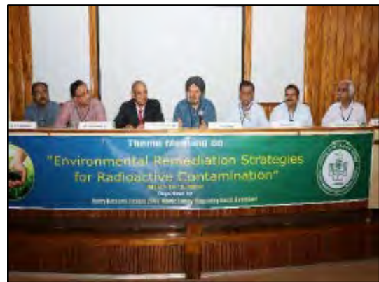
Panel discussion during the Theme Meeting