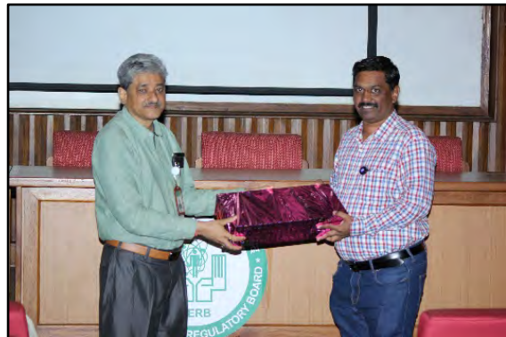
Winners of Poster Competitions receiving prize from Executive Director, AERB