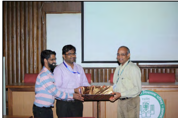
Chairman, AERB presenting prizes to winners of Cleanliness Awards