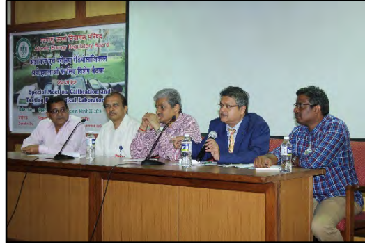
Participants interacting with Panelists during the Session